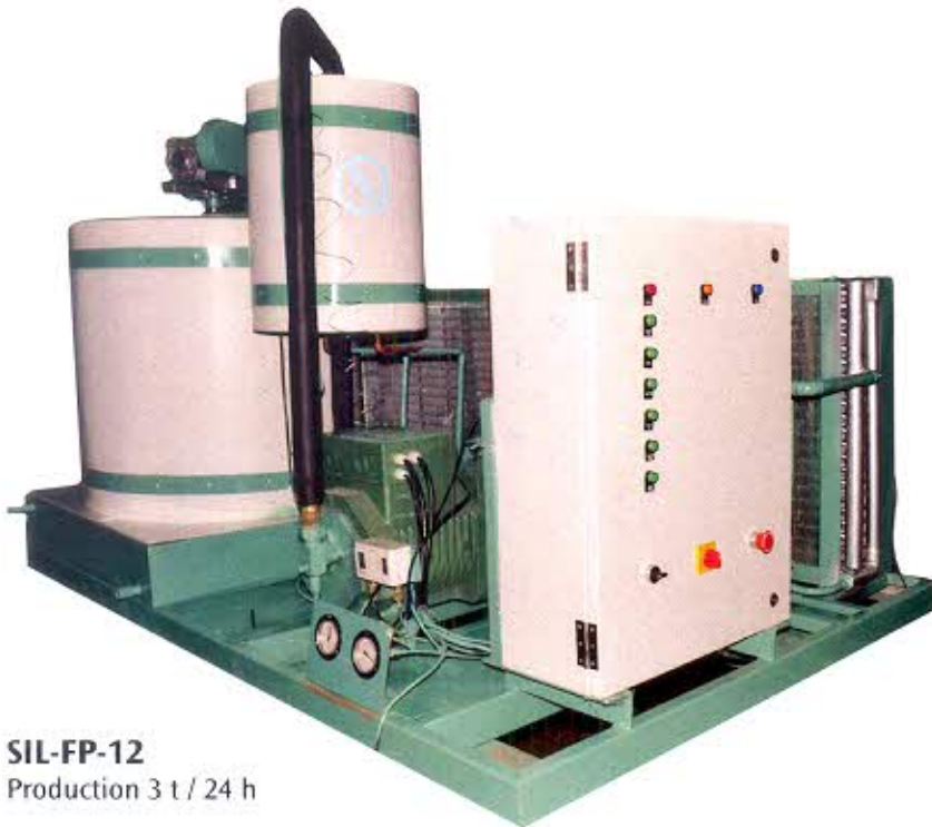
SIL-FP-12 Production 3 t / 24 h